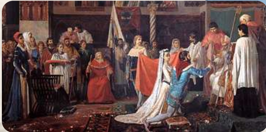
My wedding - painting