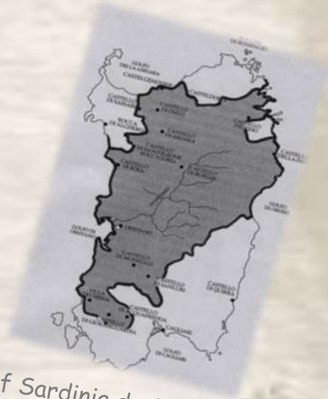
Map of Sardinia during my reign